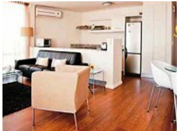
Air conditioned area