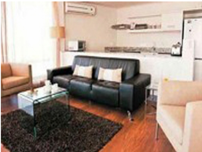
Cozy and bright living area