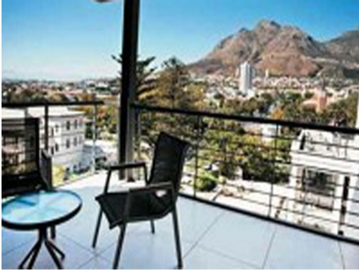
Huge balcony with sunny rest area