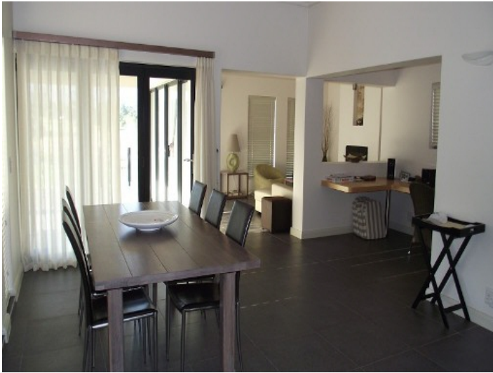
Open living and dining are with study nook