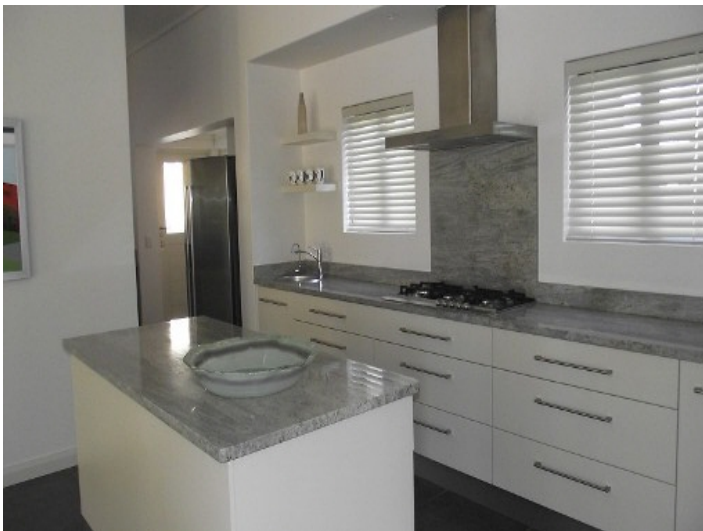
Modern kitchen with large worktops