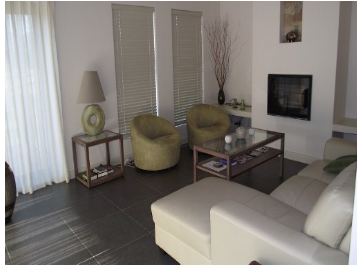
Living area with fireplace