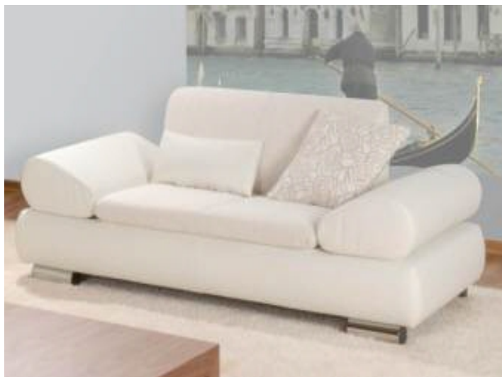
Modern living room