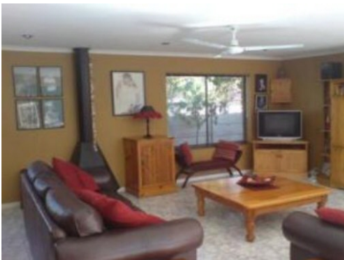
Classy living room

All information is correct to the best of our knowledge. Errors and prior sale excepted. This prospectus is purely for information purposes. Only the notarized deed of sale is legally binding.