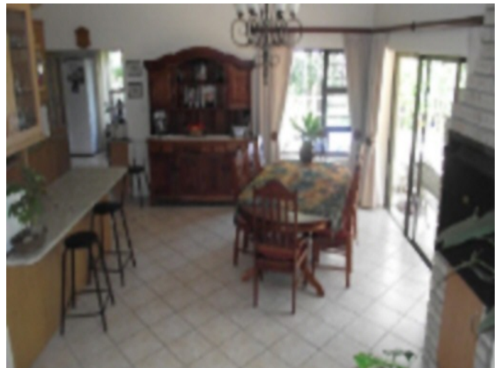
Dining room with bar

All information is correct to the best of our knowledge. Errors and prior sale excepted. This prospectus is purely for information purposes. Only the notarized deed of sale is legally binding.