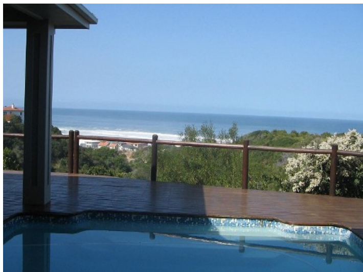
Large pool with ocean view