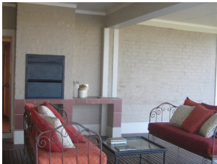
Terrace with fireplace