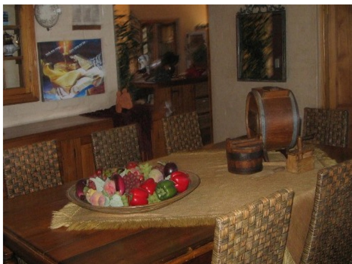
Dining room in wooden style

All information is correct to the best of our knowledge. Errors and prior sale excepted. This prospectus is purely for information purposes. Only the notarized deed of sale is legally binding.