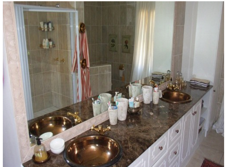
Bathroom with two basins