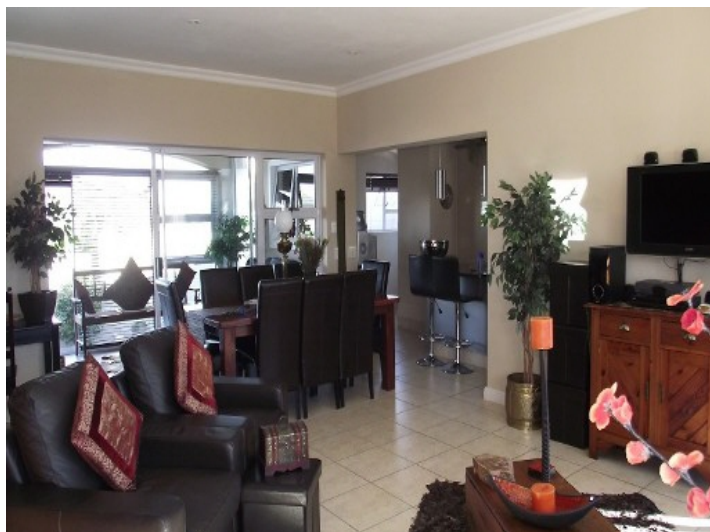
Comfortable living room