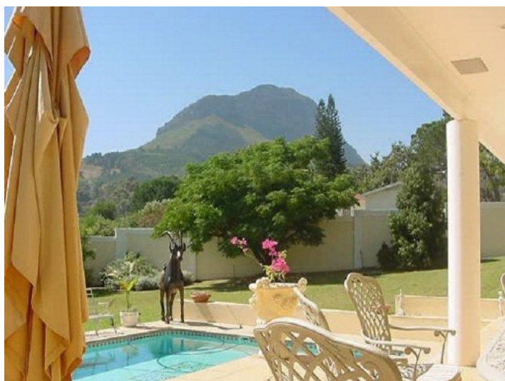
Beautiful view from the villa