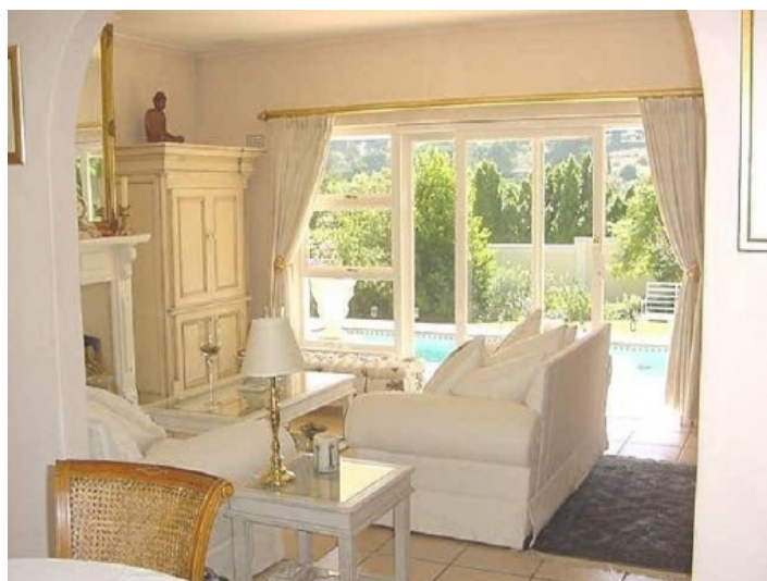
Bright living room