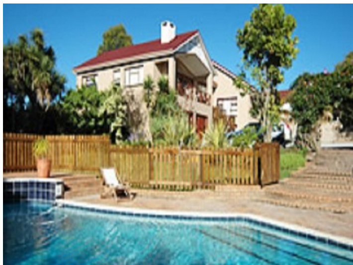
Large pool area