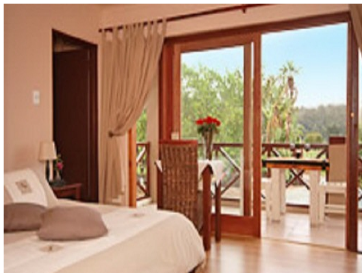
Bright bedroom with balcony