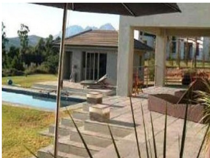
Terrace with pool and pool house as well as a garden