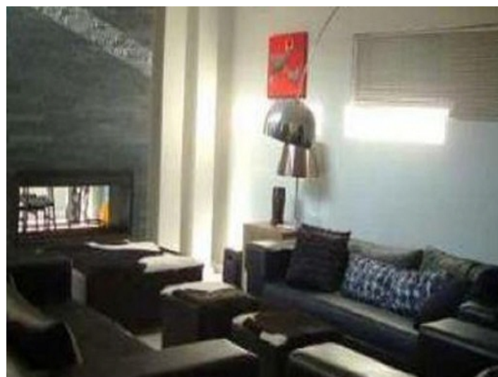
Comfortable living room