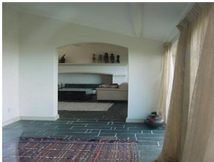
Large living area