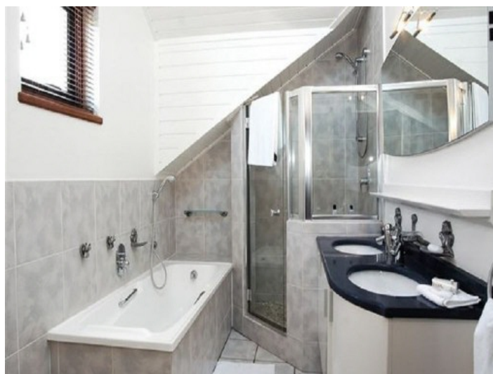
Modern bathroom with two basins