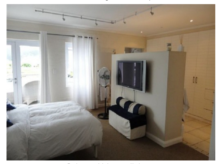
Bedroom with large wall closets