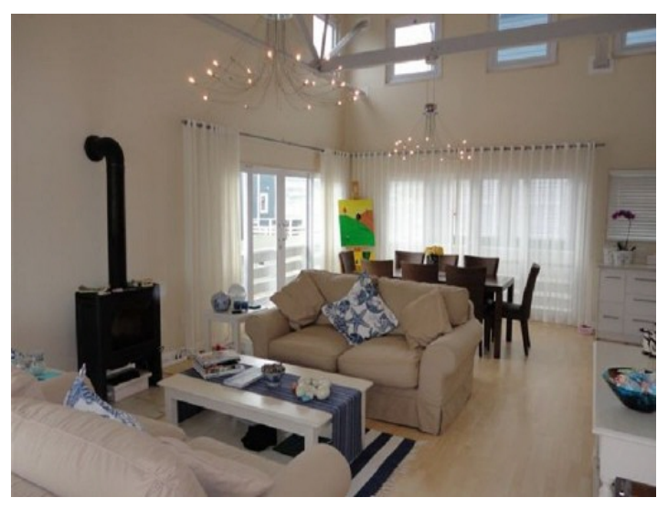
Comfortable living room with fireplace