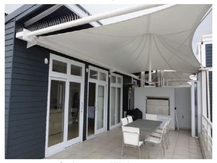
Spacious terrace with barbecue area

All information is correct to the best of our knowledge. Errors and prior sale excepted. This prospectus is purely for information purposes. Only the notarized deed of sale is legally binding.