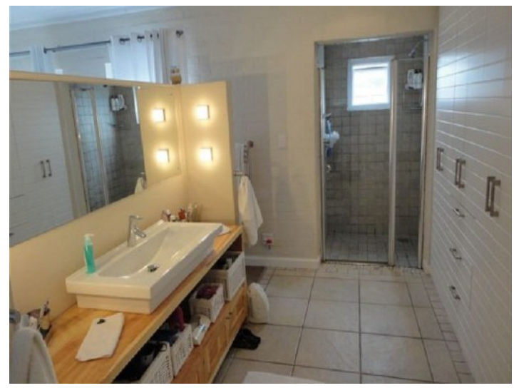
Bathroom with large wall closets and basin