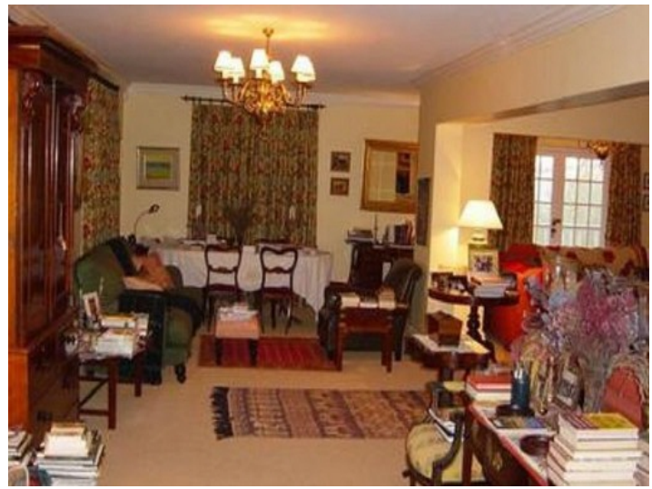
Comfortable living room