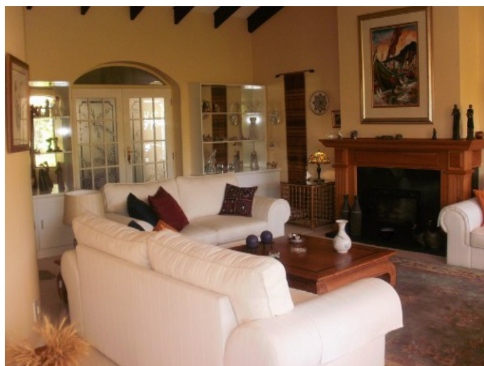
Comfortable living room

All information is correct to the best of our knowledge. Errors and prior sale excepted. This prospectus is purely for information purposes. Only the notarized deed of sale is legally binding.