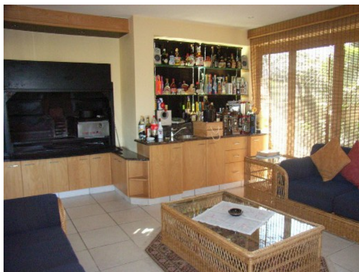
Comfortable living room

All information is correct to the best of our knowledge. Errors and prior sale excepted. This prospectus is purely for information purposes. Only the notarized deed of sale is legally binding.