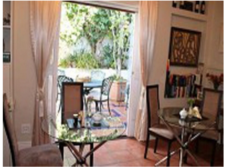
Nice living area with view to the garden