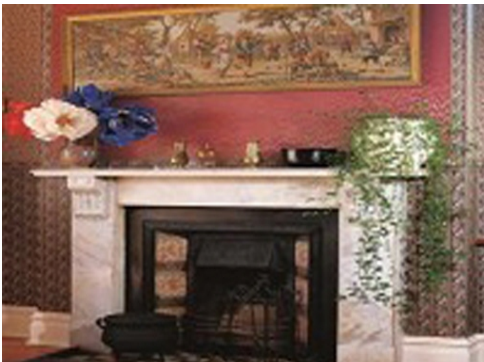
Area with cozy fireplace