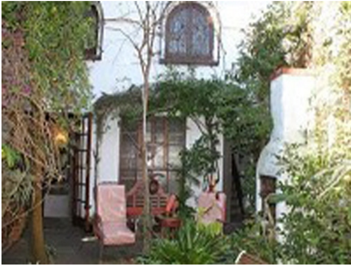
House front view