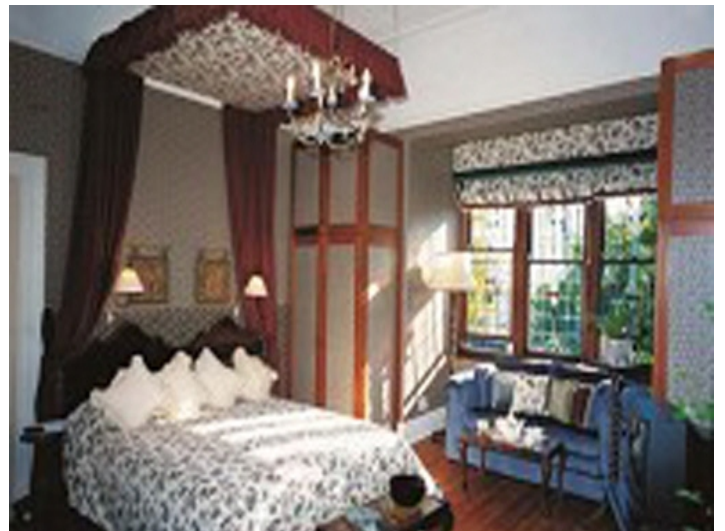
Honeymoon comfortable suite