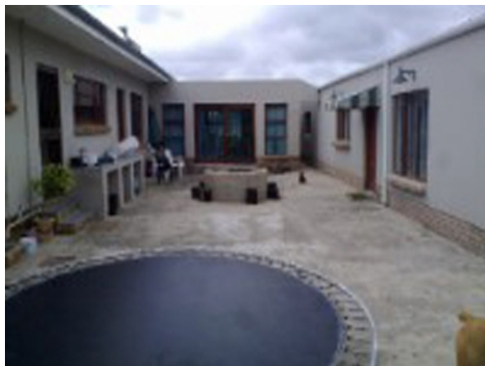
Interior property view