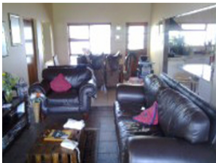
Spacious living area