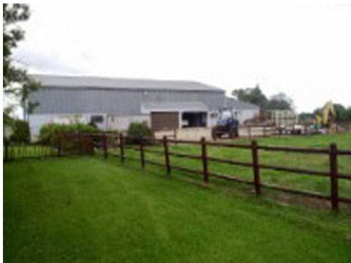
Farm area in George