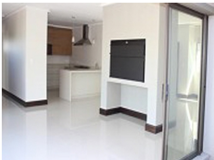
Bright living area