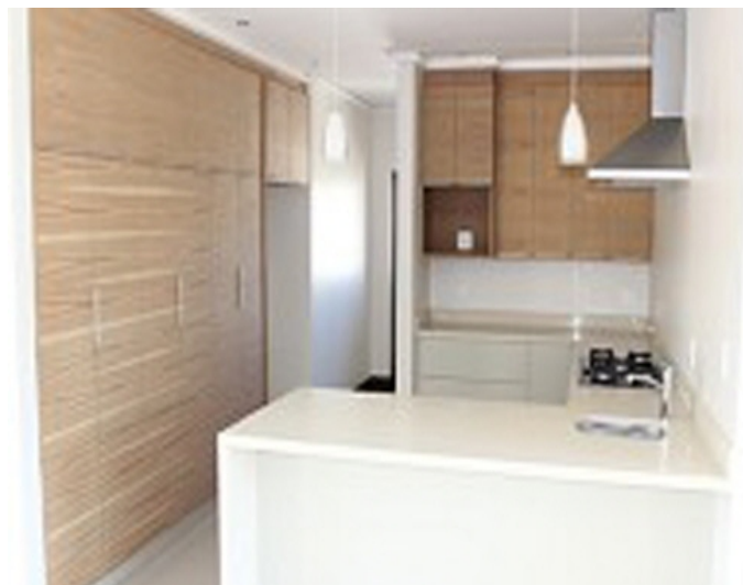
Spacious new kitchen area