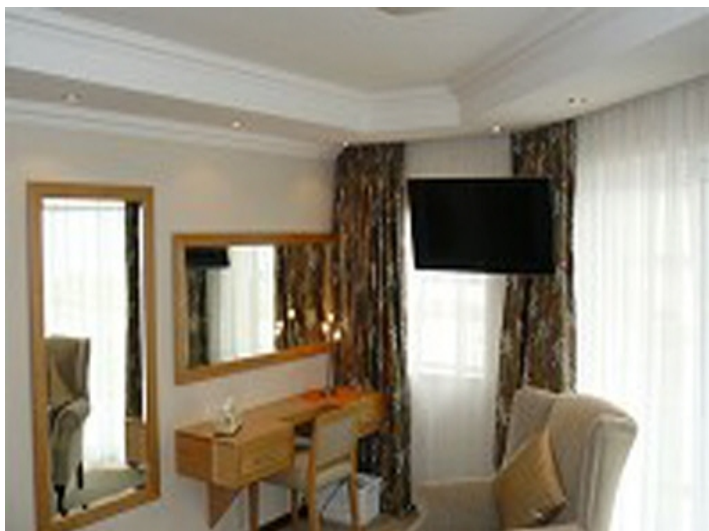
Big and comfortable living area