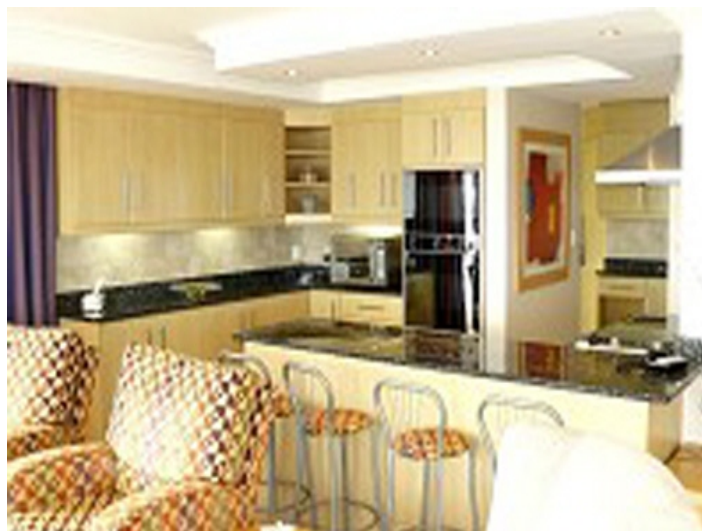
Brand new well-equipped kitchen