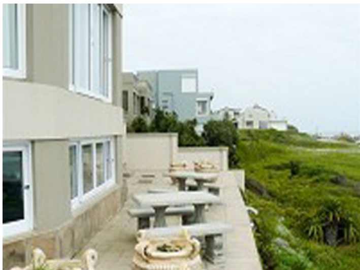
General property view