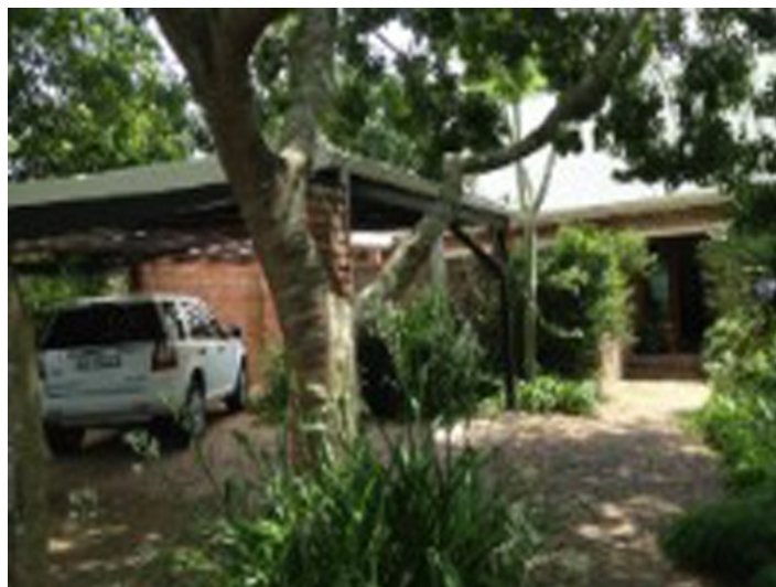
Carport available for 2 cars