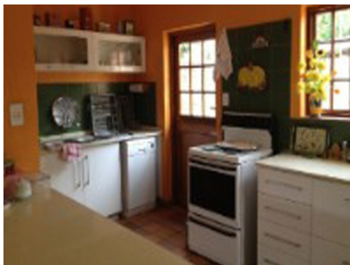
Well equipped kitchen