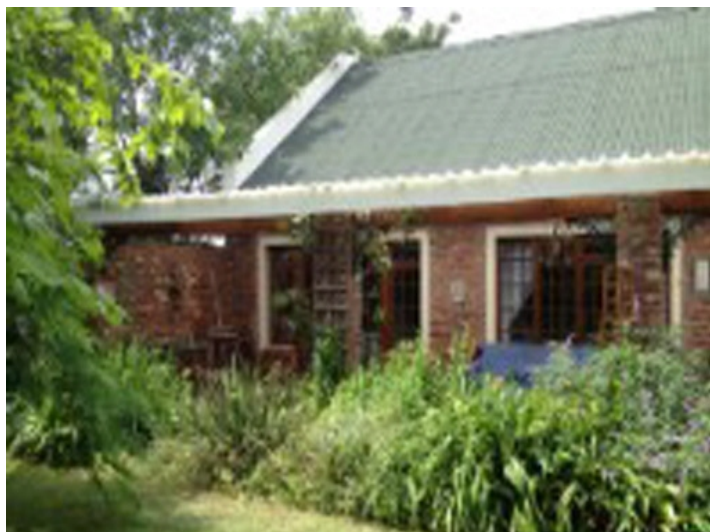
General house view