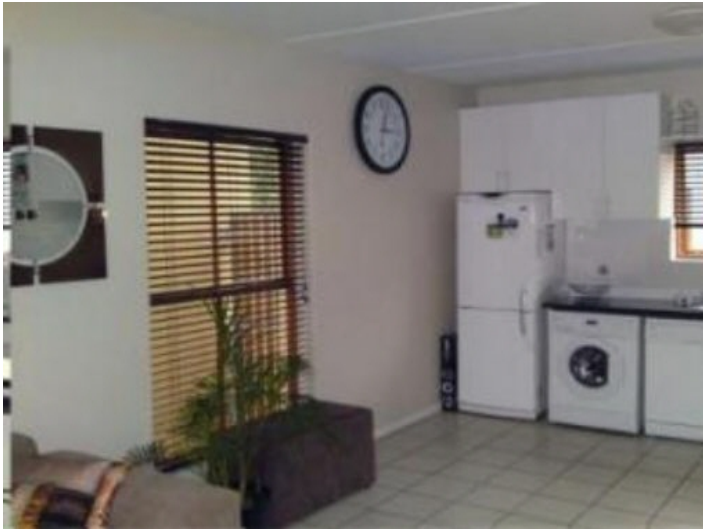
Well fitted kitchen