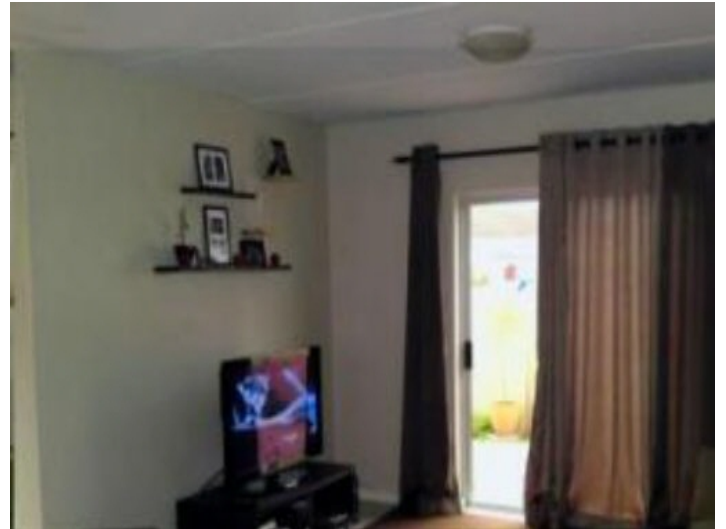
Big living room

All information is correct to the best of our knowledge. Errors and prior sale excepted. This prospectus is purely for information purposes. Only the notarized deed of sale is legally binding.