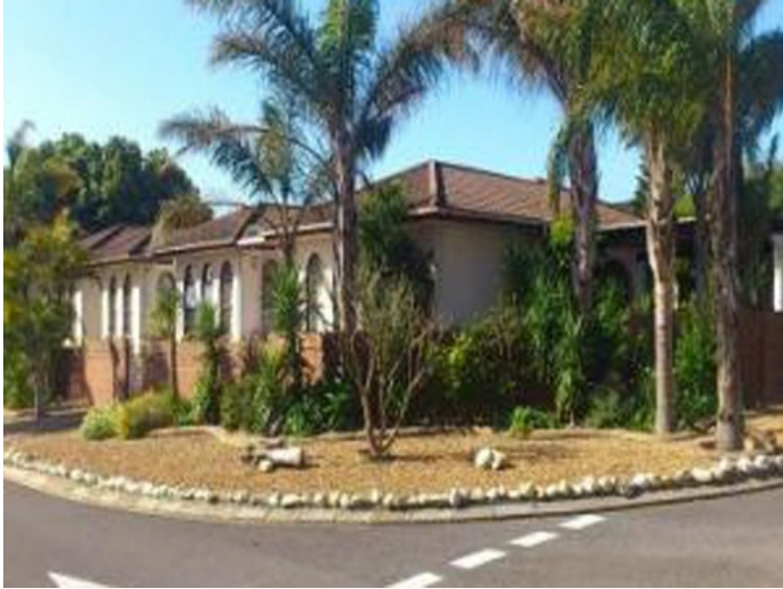
General property view