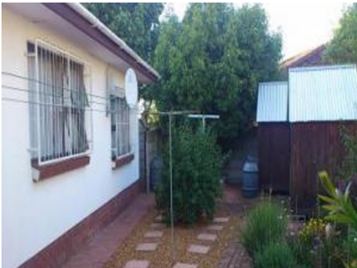
Outside view inside the property