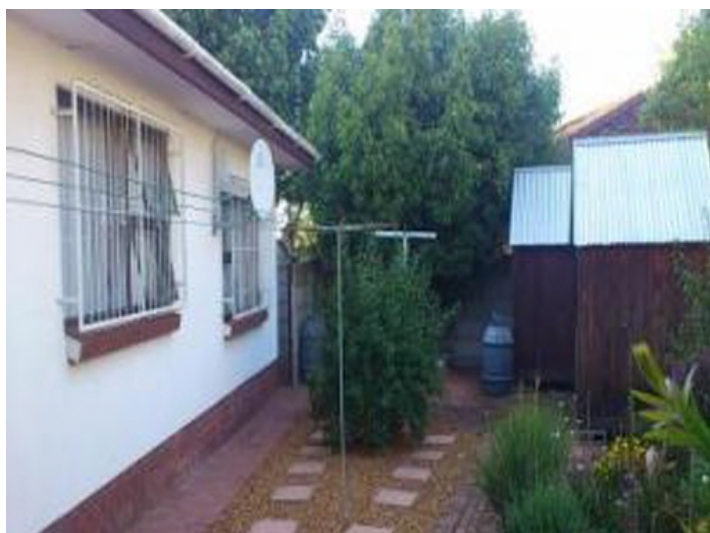
Outside view inside the property