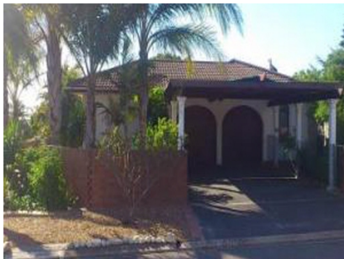
Huge carport in front of the garage