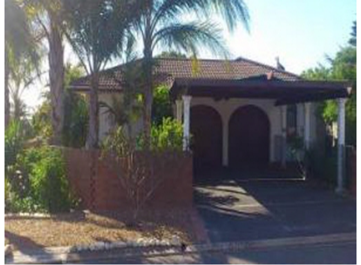
Huge carport in front of the garage