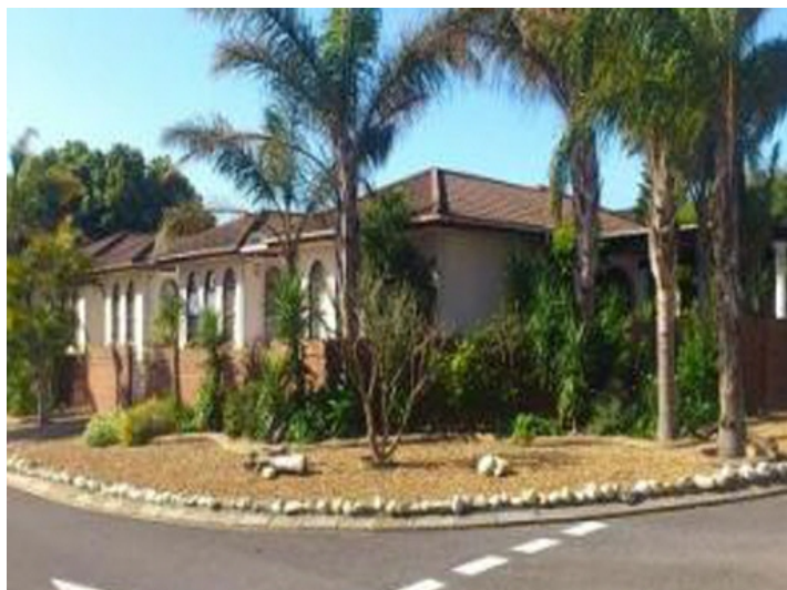
General property view