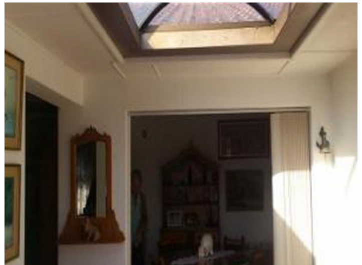
Huge and bright living room