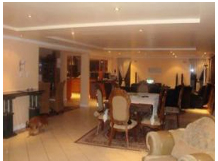
Living and dining area to enjoy time with family and friends