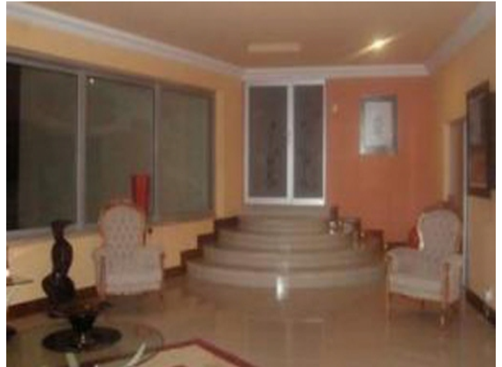
Huge living area in the main house