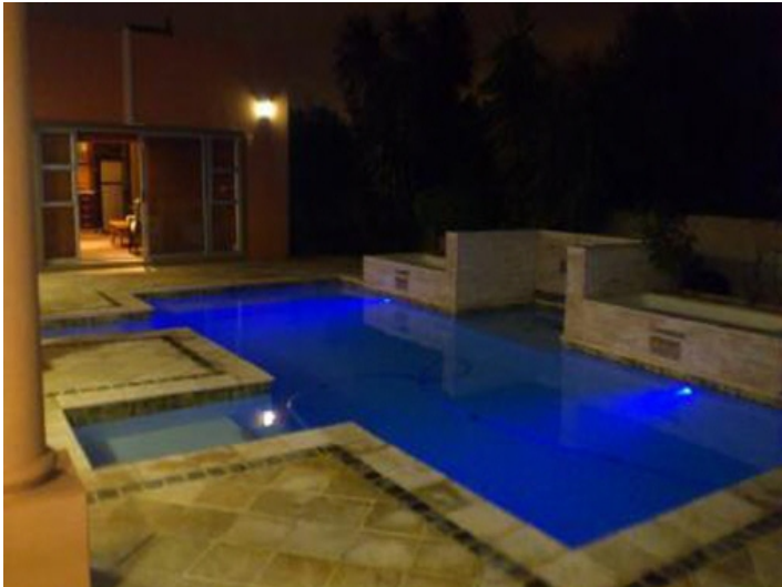
Pool area during the night