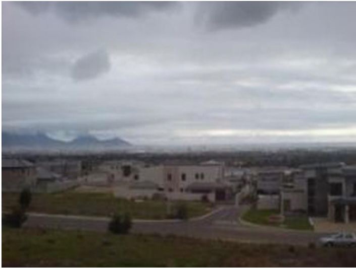
Beautiful view to the mountains area