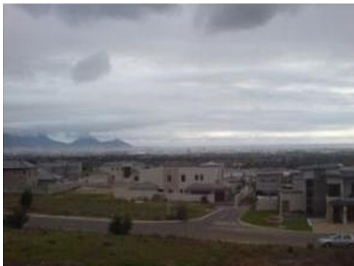
Beautiful view to the mountains area