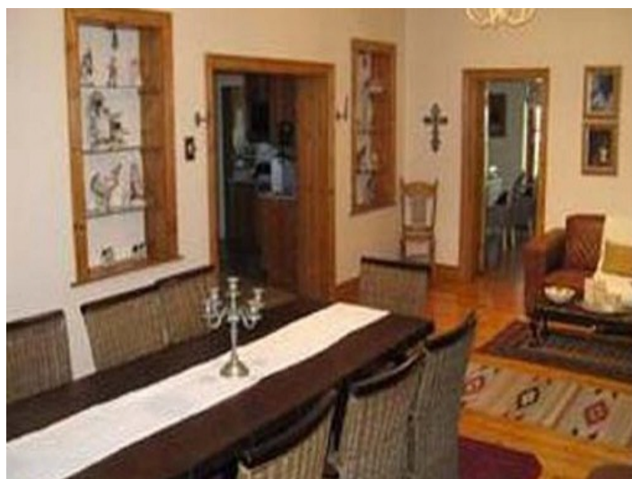
Long table in the dining room