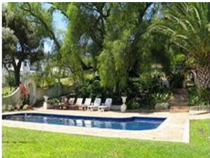
Pool situated in the extensive garden