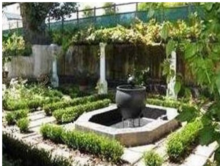
Extras given in the garden