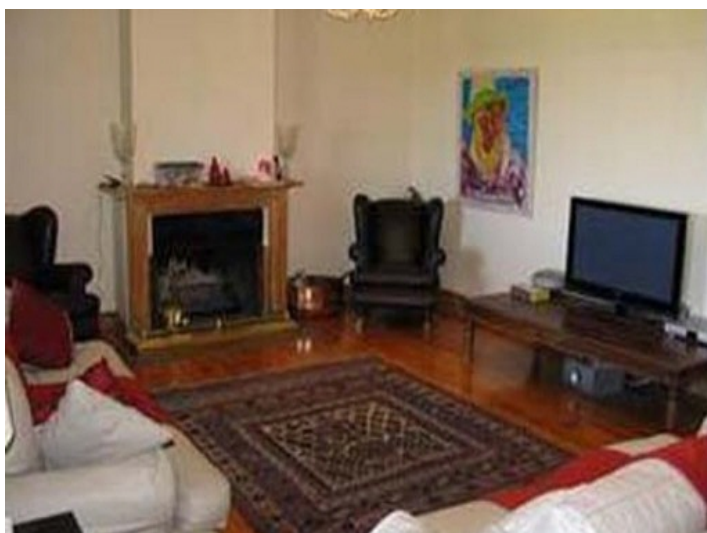
Rustic living room with fireplace