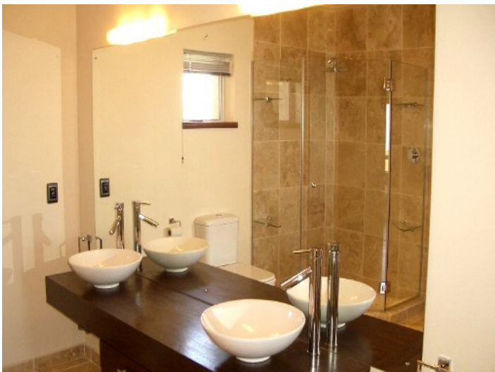
Modern bathroom with two basins