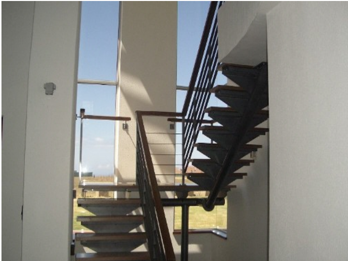
Staircase with large windows