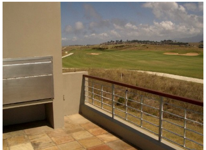
View from one of the two balconies

All information is correct to the best of our knowledge. Errors and prior sale excepted. This prospectus is purely for information purposes. Only the notarized deed of sale is legally binding.