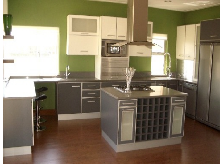
Modern kitchen with best interior