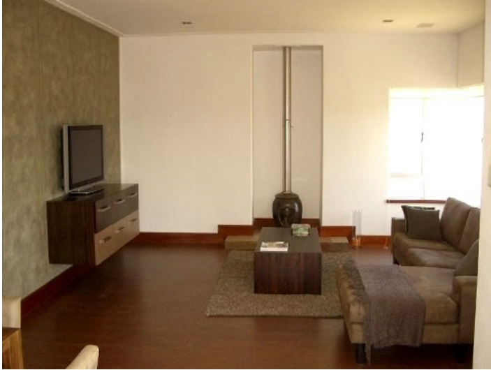
Part of the living area