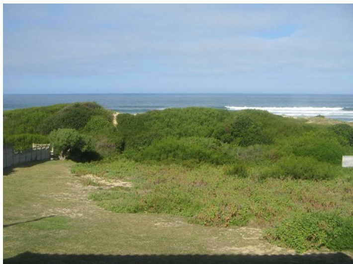
Views of the sea