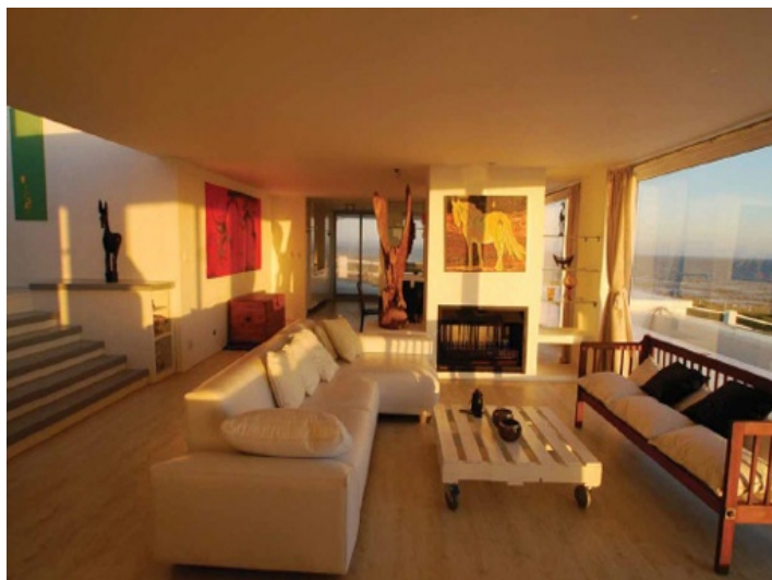
Living Room with a large sofa