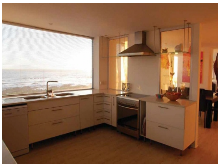
Full equipped kitchen