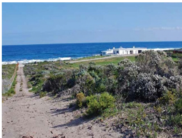
Path to the property