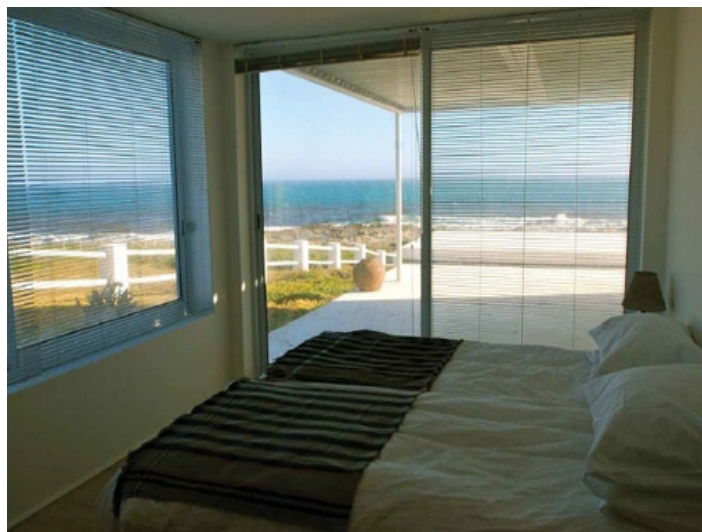
Bedroom with nice sea view